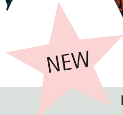
MODEL FREYA Silk Scarf, multi coloured 135 x 135 cm