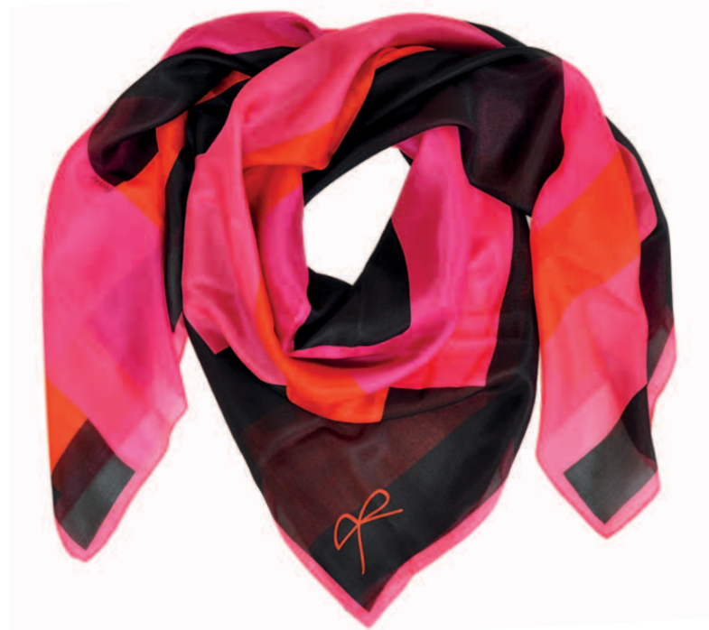
MODEL RUBY Silk Scarf, multi coloured 135 x 135 cm