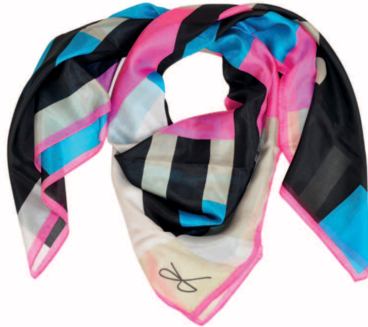
MODEL CAT Silk Scarf, multi coloured 135 x 135 cm