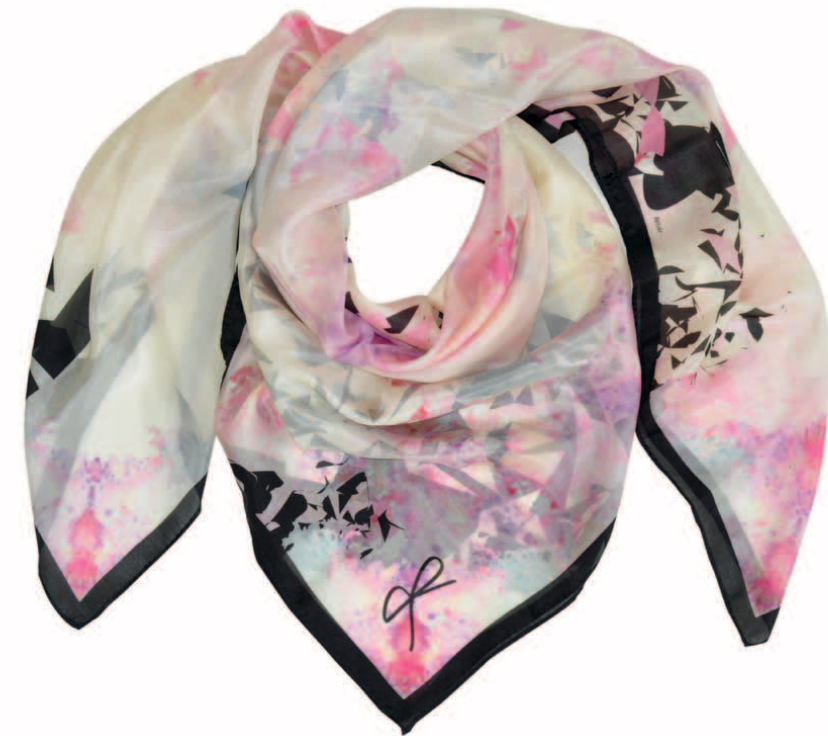
MODEL AMBER Silk Scarf, multi coloured 135 x 135 cm