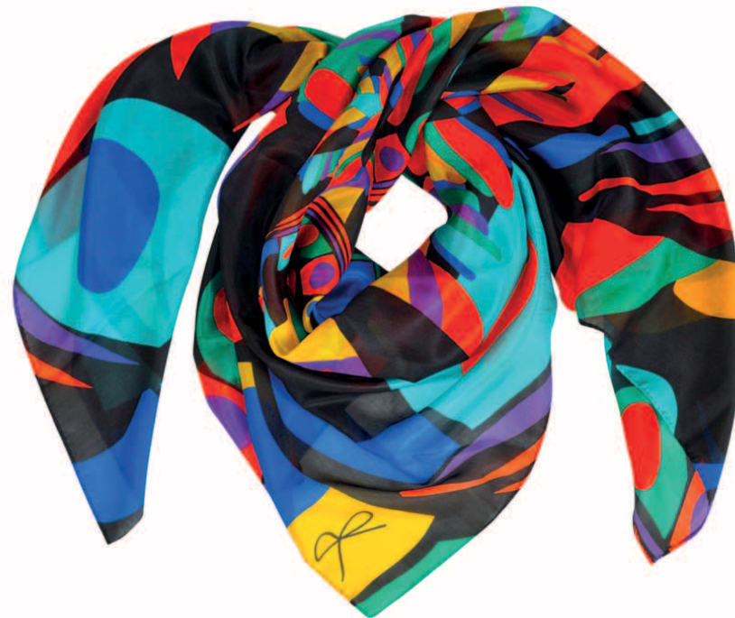
MODEL RIO Silk Scarf, multi coloured 135 x 135 cm