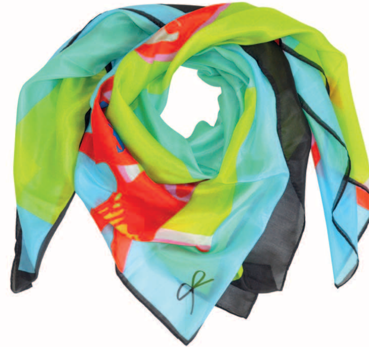
MODEL BIRDS Silk Scarf, multi coloured 135 x 135 cm