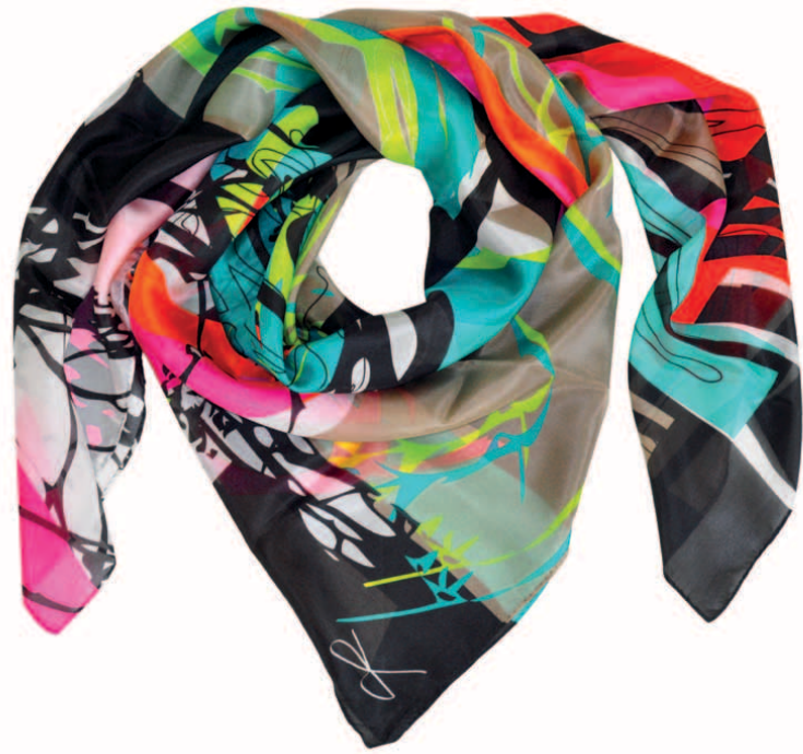
MODEL IVY Silk Scarf, multi coloured 135 x 135 cm